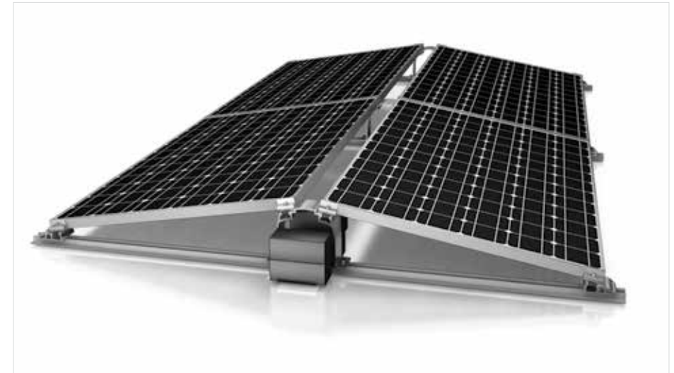
Detail illustration - D-Dome System